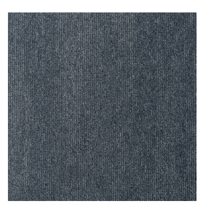
Translate - 76 Stone