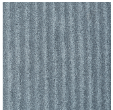
Translate - 72 Pewter