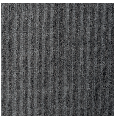
Translate - 75 Concrete