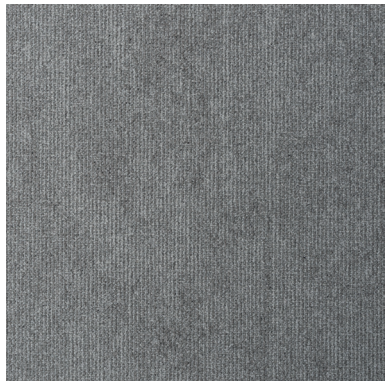
Translate - 74 Clay