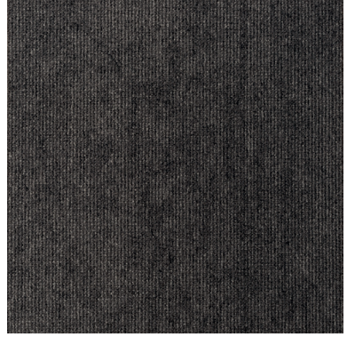
Translate - 90 Peat