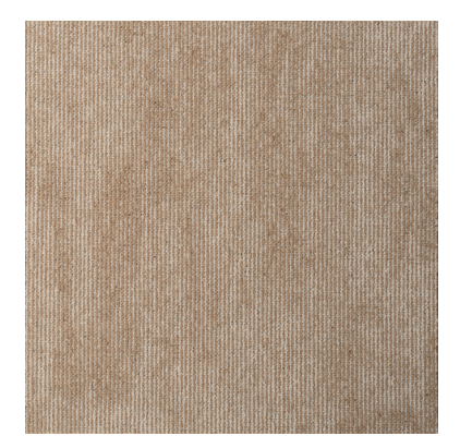
Translate - 62 Grain