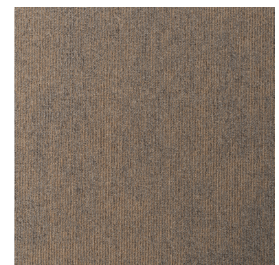
Translate - 64 Hemp