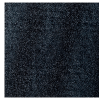
Translate - 78 Slate