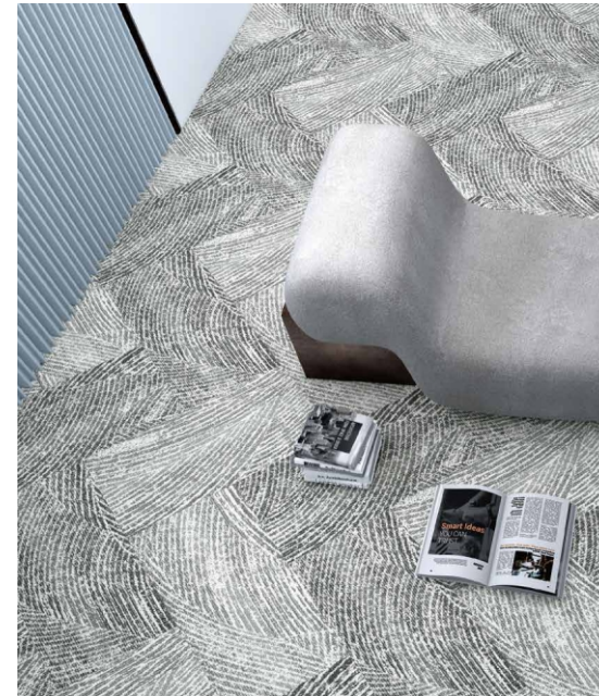
Symphony 08 09